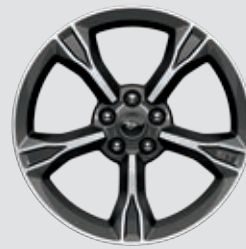
19" Ebony Black-Painted Machined Aluminum Included: GT Premium California Special