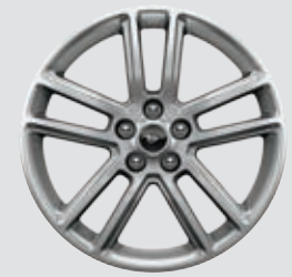
19" Polished Aluminum Included: EcoBoost Premium Pony Package