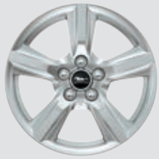
17" Sparkle Silver-Painted Aluminum Standard: V6