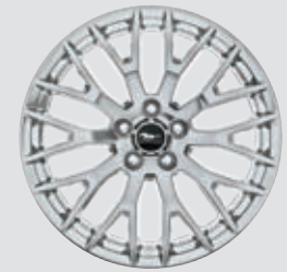
19" x 9" Front/19" x 9.5" Rear Luster Nickel-Painted Aluminum Optional: GT Performance Package