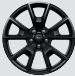
19" Ebony Black-Painted Aluminum Included: GT Black Accent Package