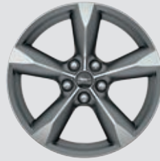
18" Foundry Black-Painted Machined Aluminum Included: V6 051A Optional: EcoBoost, EcoBoost Premium, GT, GT Premium