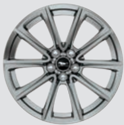
19" Premium Dark Stainless- Painted Aluminum Optional: GT Premium