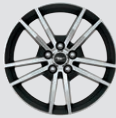
18" Magnetic-Painted Machined Aluminum Standard: EcoBoost®, EcoBoost Premium, GT, GT Premium