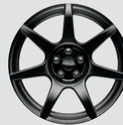
19" x 11" Front/19" x 11.5" Rear Ebony Black-Painted Carbon-Fiber Included: Shelby GT350R Package