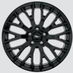
19" x 9" Front/19" x 9.5" Rear Ebony Black-Painted Aluminum Included: GT Performance Package