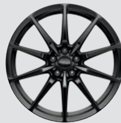
19" x 10.5" Front/19" x 11" Rear Ebony Black-Painted Aluminum Standard: Shelby GT350