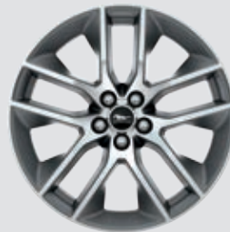
20" x 9" Foundry Black-Painted Machined Aluminum Optional: EcoBoost Premium, GT Premium