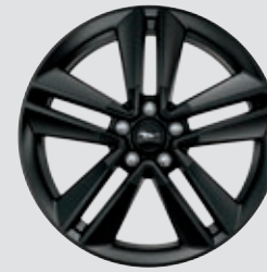
19" Ebony Black-Painted Aluminum Included: EcoBoost Performance Package