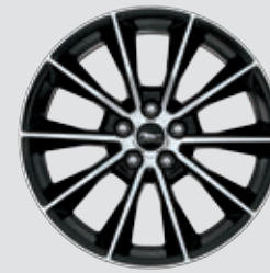
19" Low-Gloss Black-Painted Machined Aluminum Included: EcoBoost Interior & Wheel Package, Wheel & Stripe Package, GT Interior & Wheel Package